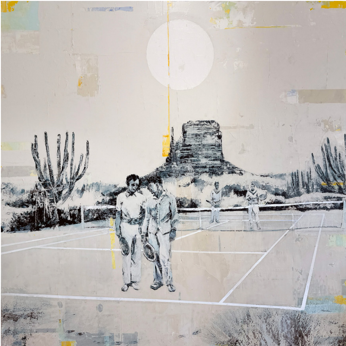
Holding Court 48" x 48", , Acrylic, mixed media, ink on wood panel Mark Gabriel