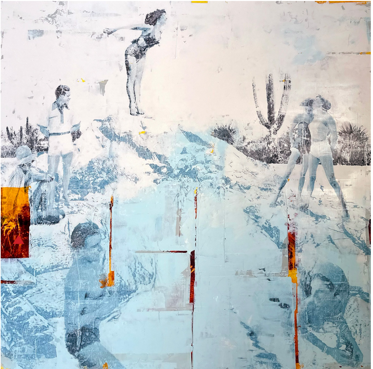
At the Grotto (Work-In-Progress) 48" x 36", Acrylic, mixed media, ink on wood panel Mark Gabriel

Will be pre-sold, Finished by end of December 7200 / SOLD