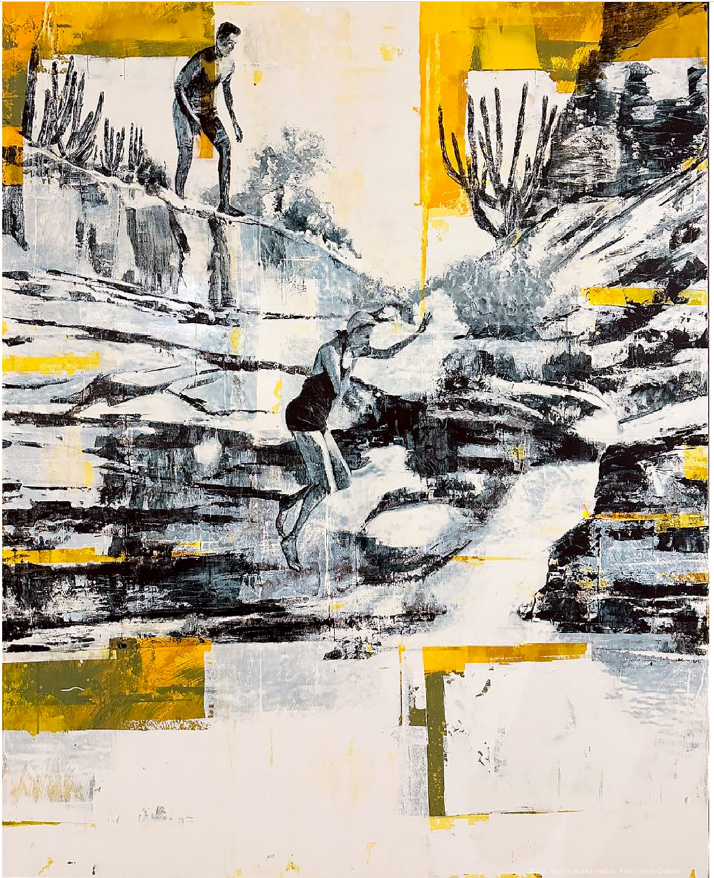
Forbidden River 60" x 48", Acrylic, mixed media, ink on wood panel Mark Gabriel