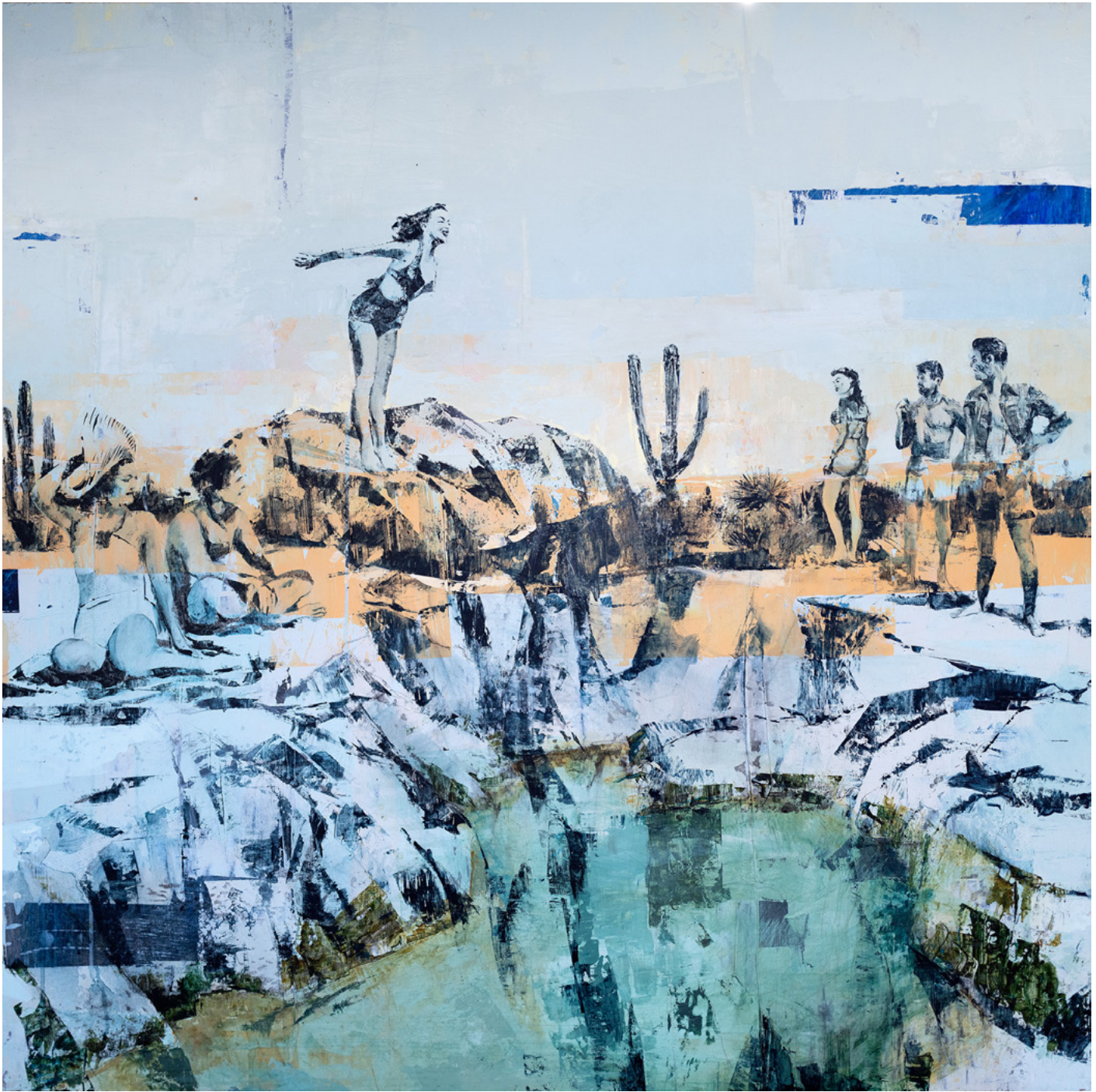
Desert Grotto 48" x 48", Acrylic, mixed media, ink on wood panel Mark Gabriel