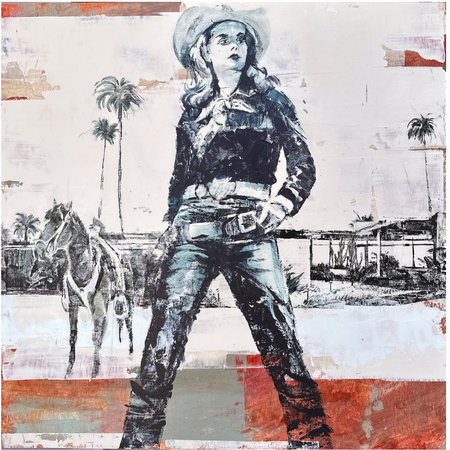
New Sheriff in Town 24" x 24", Acrylic, mixed media, ink on wood panel Mark Gabriel