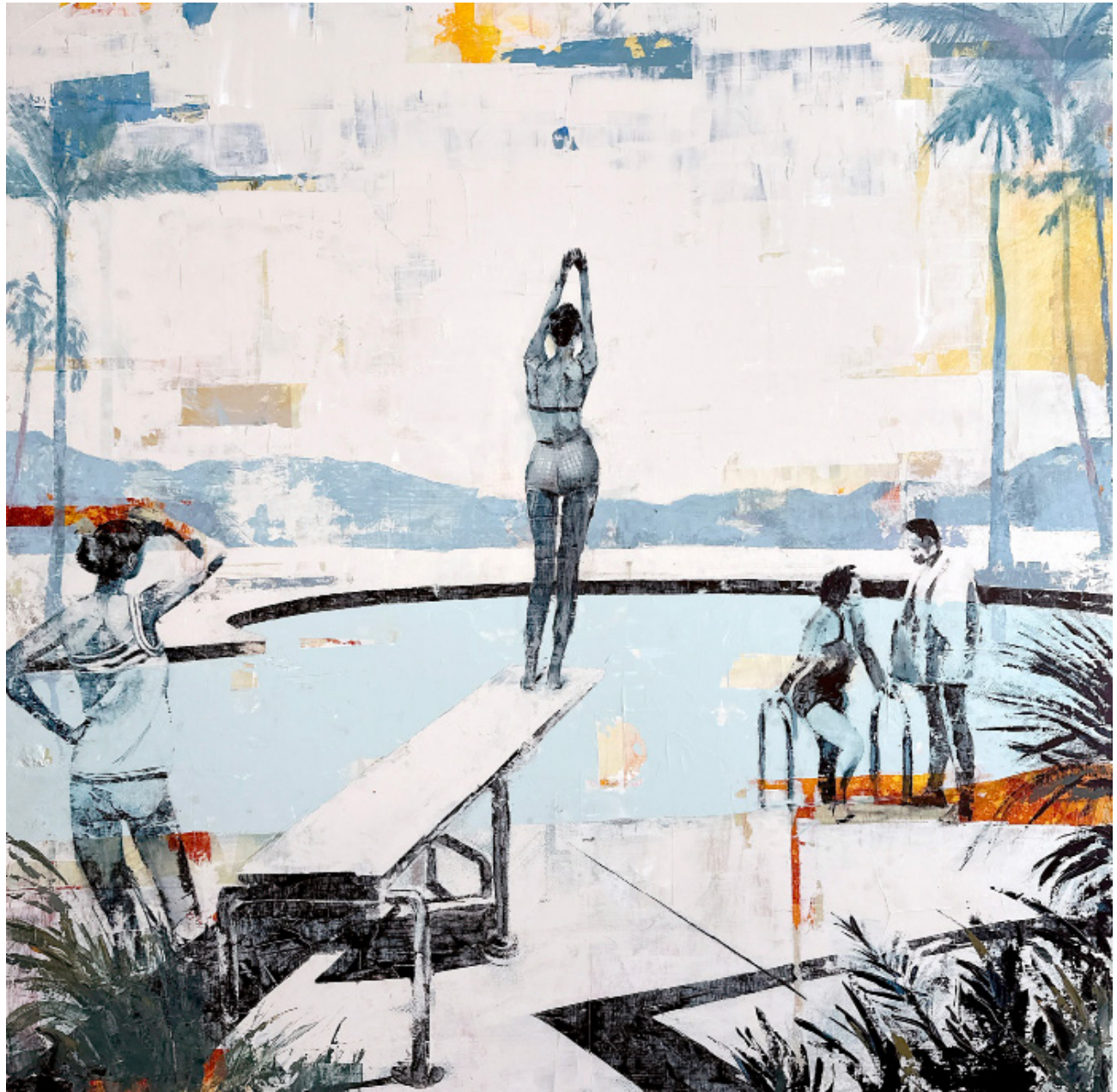
A Sweeter Oblivion (Details) 48" x 48", Acrylic, mixed media, ink on wood panel Mark Gabriel 7200 / SOLD