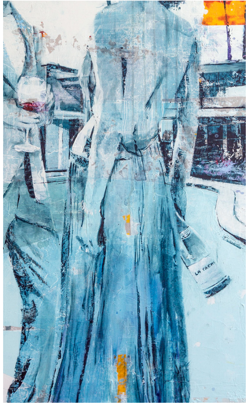
Gossip Girls 48" x 36", Acrylic, mixed media, ink on wood panel Mark Gabriel