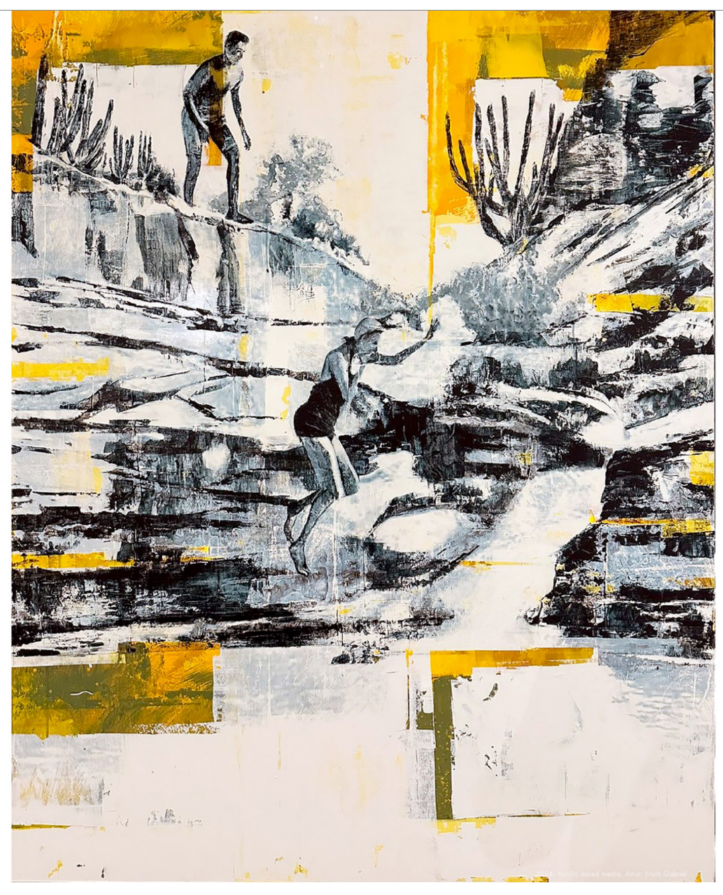
Forbidden River 60" x 48", Acrylic, mixed media, ink on wood panel Mark Gabriel