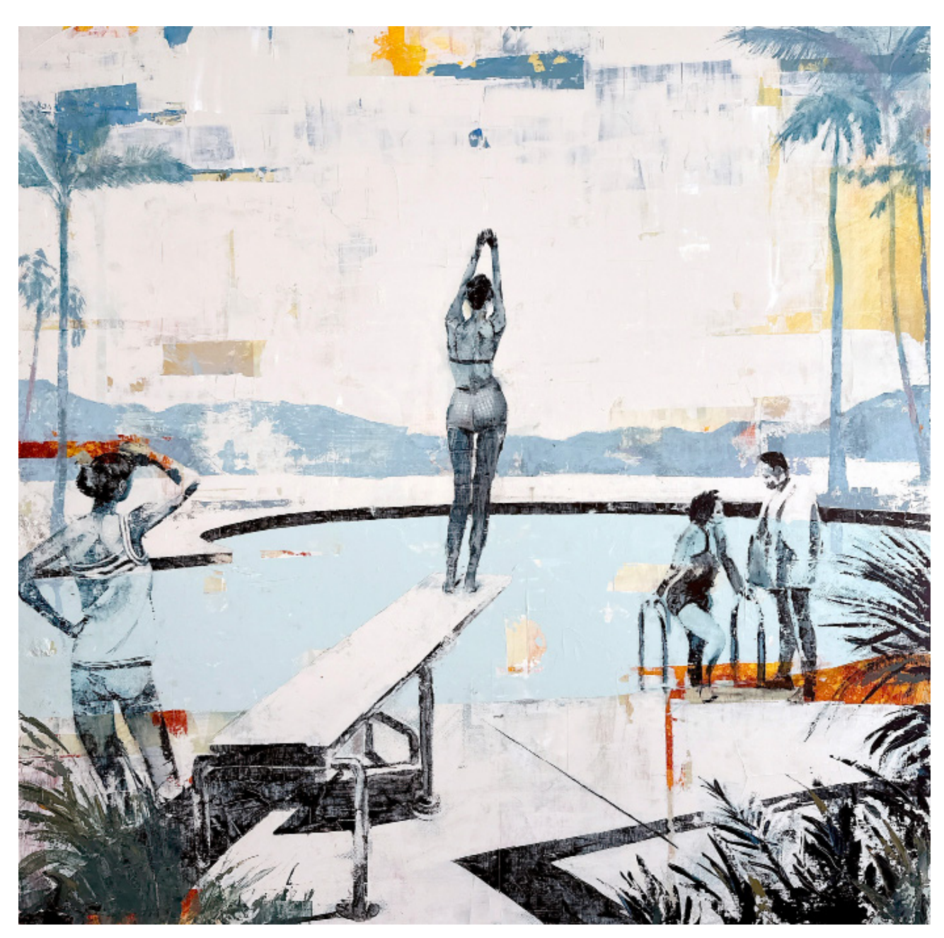
A Sweeter Oblivion (Details) 48" x 48", Acrylic, mixed media, ink on wood panel Mark Gabriel 7200 / SOLD