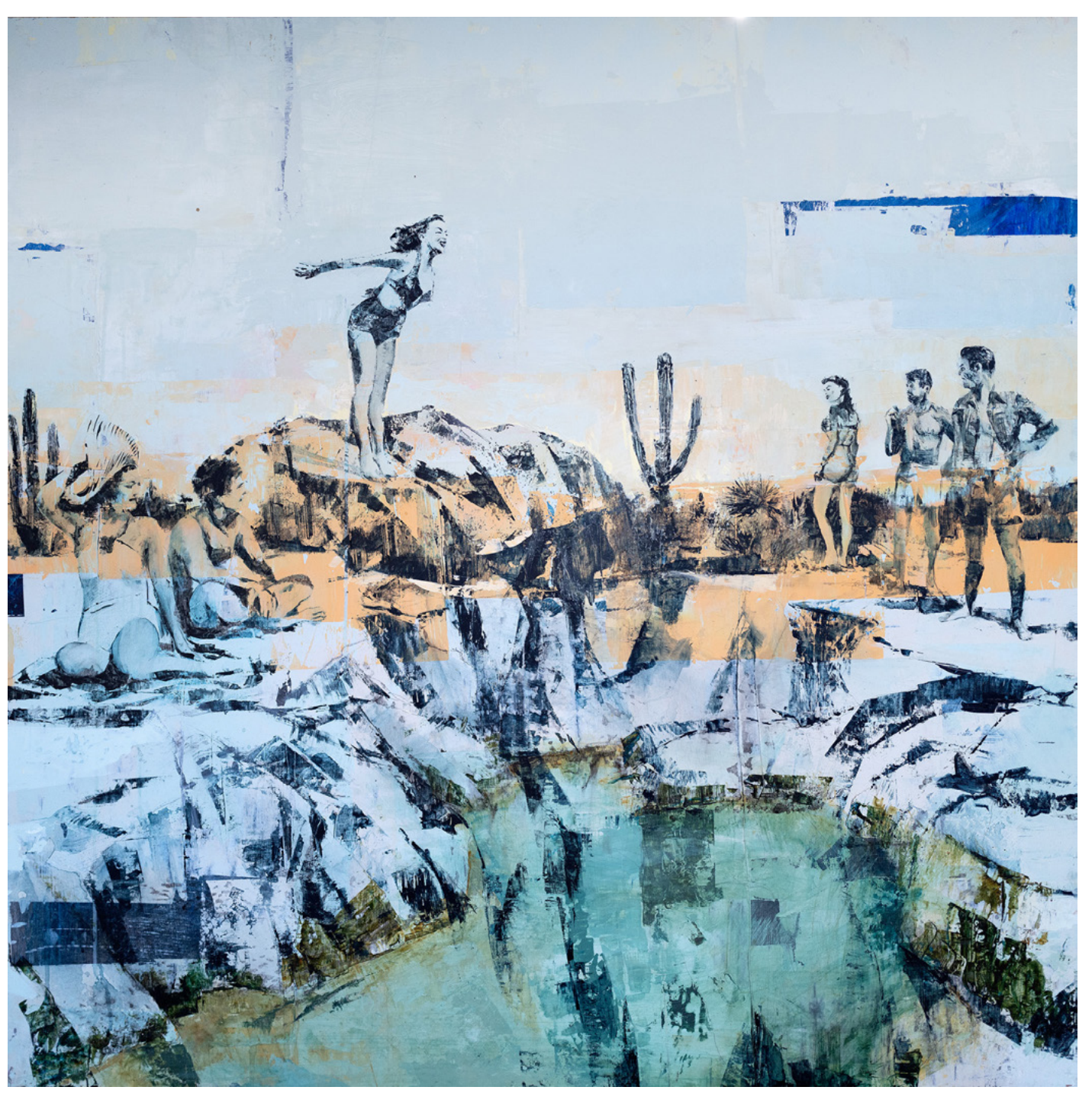
Desert Grotto 48" x 48", Acrylic, mixed media, ink on wood panel Mark Gabriel