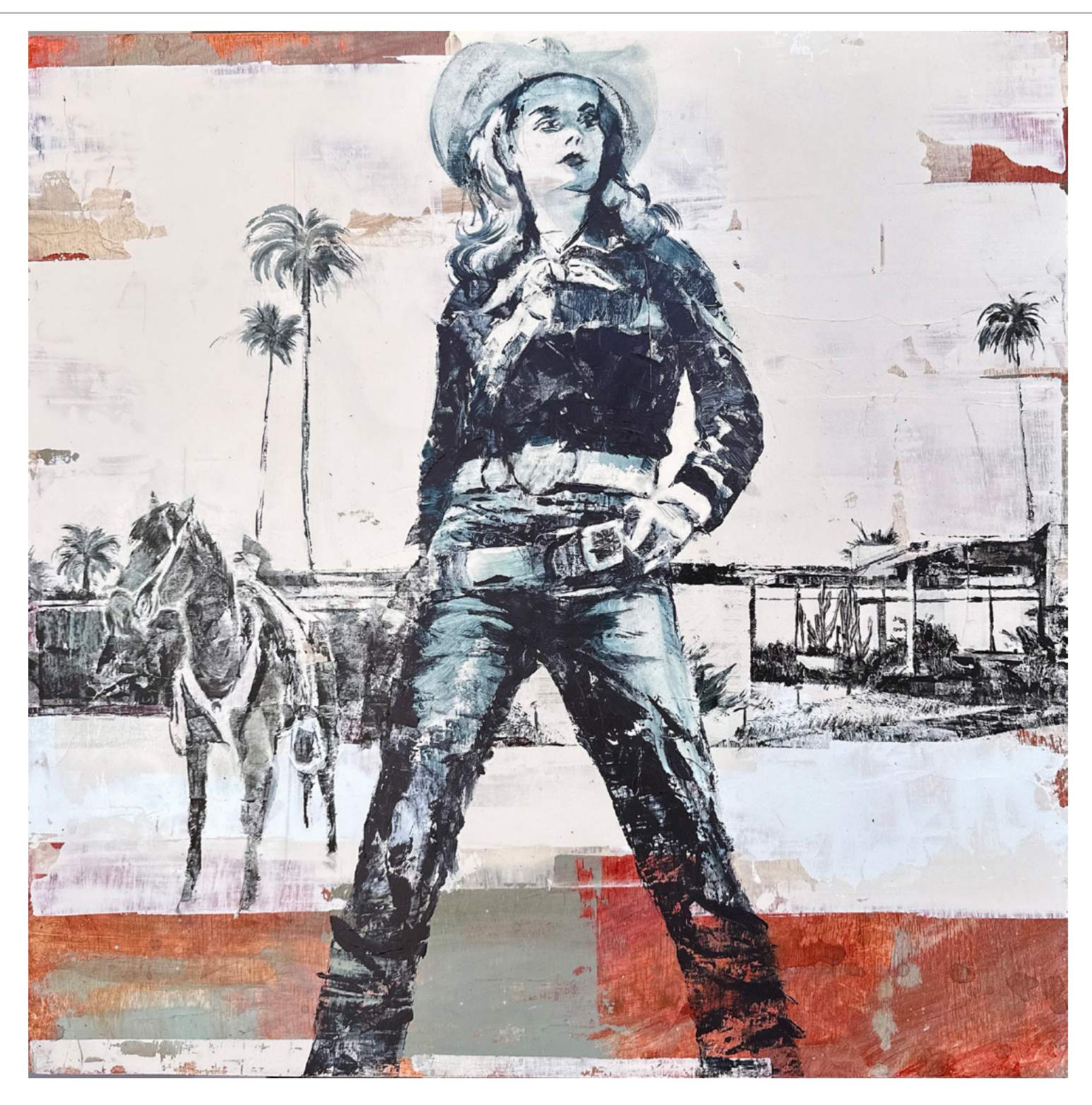
New Sheriff in Town 24" x 24", Acrylic, mixed media, ink on wood panel Mark Gabriel