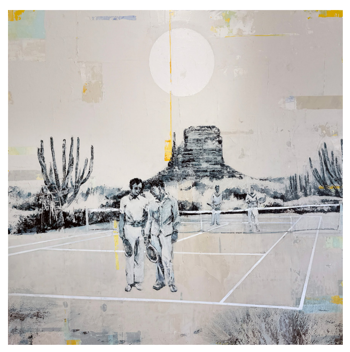
Holding Court 48" x 48", , Acrylic, mixed media, ink on wood panel Mark Gabriel