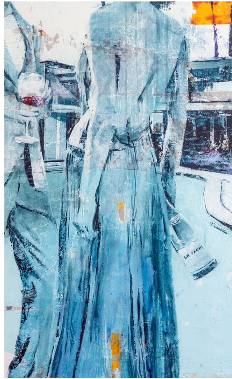
Gossip Girls 48" x 36", Acrylic, mixed media, ink on wood panel Mark Gabriel